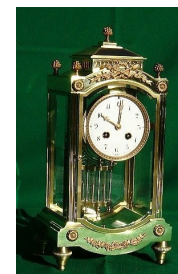
A Gold Plated Clock using Plug N' Plate™

I am a watchmaker in Scottsdale, Arizona and I specialize in restorations of fine antique watches and clocks. I was recently commissioned to restore a one-of-a-kind French clock, Circa. 1860 which was ornamented with hand-made, gilded accents. The original gold was long gone due to improper handling. Because the clock is irreplaceable as are the hand-made accent pieces, I did not feel comfortable in sending them to another state for plating because of the possibility of loss or damage. I bought one of your plug-and-plate kits to see if I could achieve a good finish at my own bench.